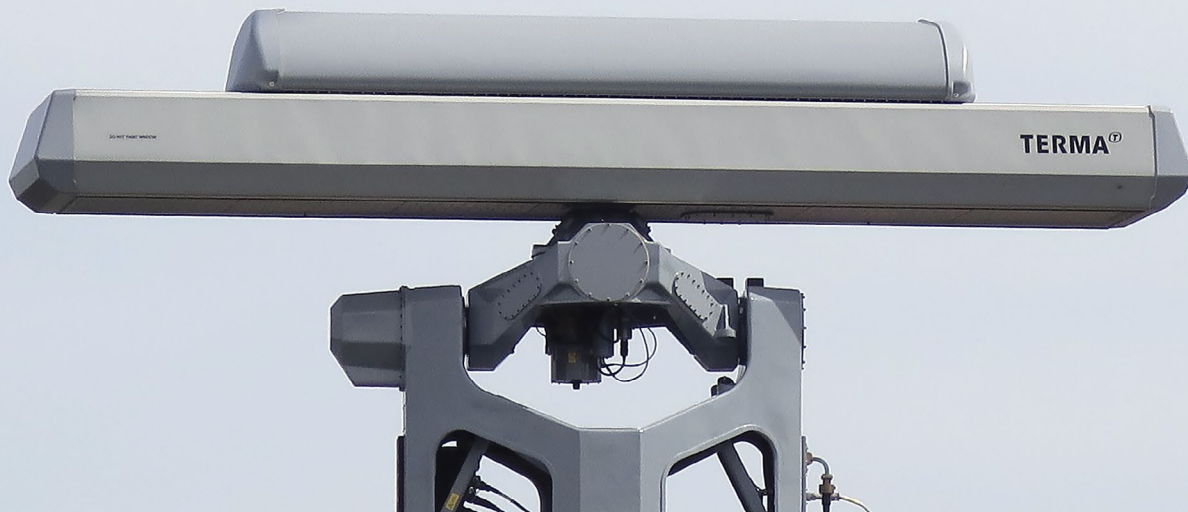
12' Dual Beam High Gain antenna with IFF antenna on a light-weight stabilized platform - one of the available antenna systems