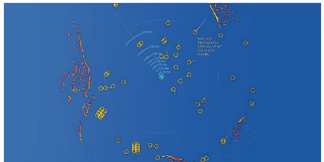
Crisp and clear radar video from SCANTER 4603

Terma has more than 60 years of Surveillance & Mission Systems experience and more than 3,000 radar systems in service worldwide. Navies, Coast Guards, and other high-demanding authorities around the world rely on our high resolution surveillance capabilities for securing the maritime domain and the sea lines of communication.